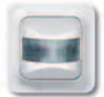
Flush-mounted movement detector