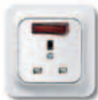
British Standard socket-outlet