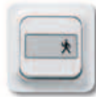
Switch with labelling field