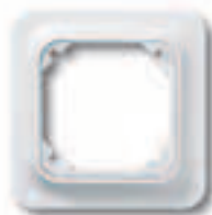
Frame, 1-gang ...