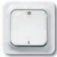
Switch marked 0/1