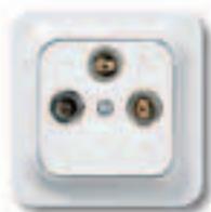
Antenna socket-outlet, 3-gang