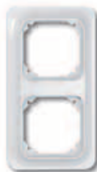
... 2-gang ...