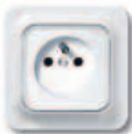
Socket-outlet with earth pin