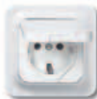
SCHUKO® socket-outlet with hinged lid