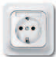
SCHUKO® socket-outlet with labelling field