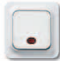
Push-down button with symbol window