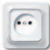
Socket-outlet without earth pin