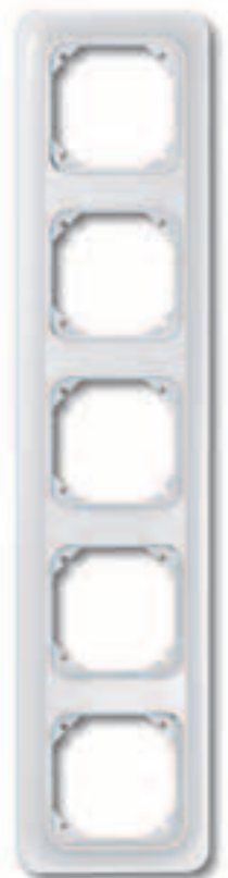
... up to 5-gang