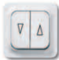
Roller shutter push-button