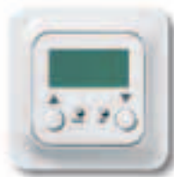
Blind time switch