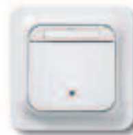
Hotel keycard holder