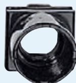
Slide with gland