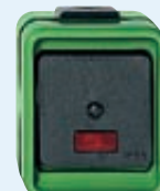
Rocker control switch