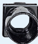
Slide with gland