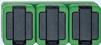
Schuko® triple socket-outlet