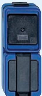
Combination Schuko® socket-outlet / two-way switch