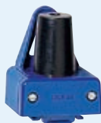
Hanger with bend protection sleeve and strain relief