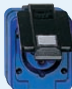
CEE 17 socket-outlet